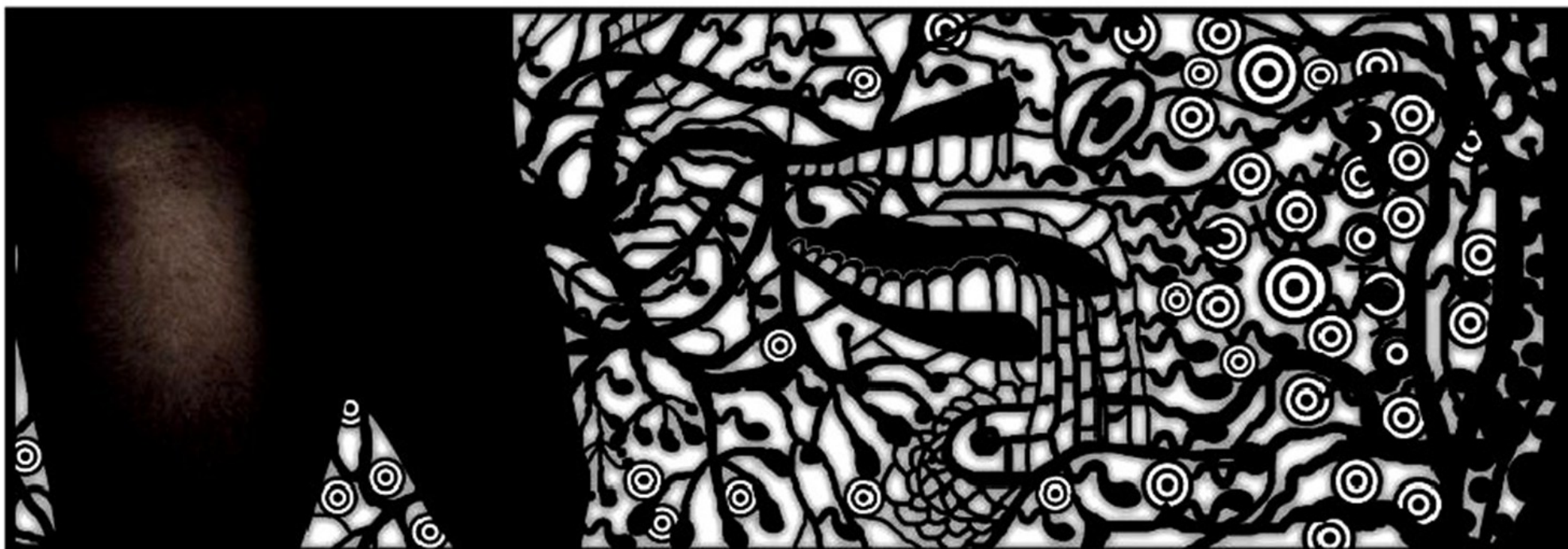
“Trace - 1”

Digital print on Vms Lustre Fine Art Paper